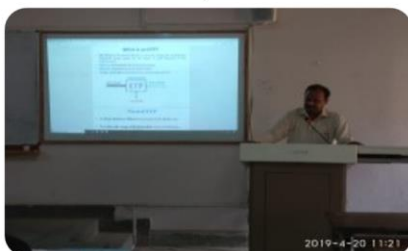
Twinning activity at UPTTI Kanpur