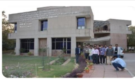
PreIncubation activity at IIT Kanpur