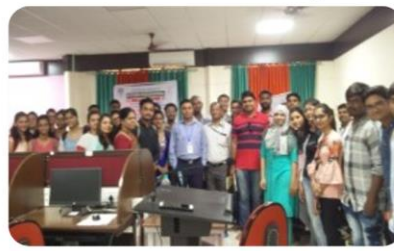
Workshop on Python Programming for students