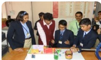
Science Day Model Exhibition